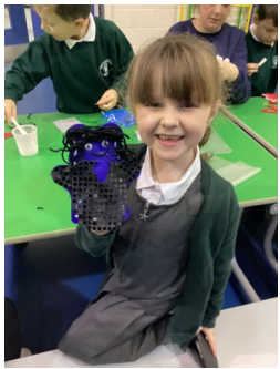
Year One sewed hand puppets as part of their Textiles topic in Design Technology

At Wellesbourne, our aim is to create a happy and secure environment, where children will develop confidence and an eagerness to learn. We recognise that as parents, you are an important educator in your child's life and it is our wish to create positive partnerships with families from the outset. During Stay, Play and Learn sessions, we welcome family members to come and work with your children and enjoy activities involving Art, Design Technology, Reading, games and much more. It gives you the opportunity to see your child interact with other children and learn in a relaxed environment.