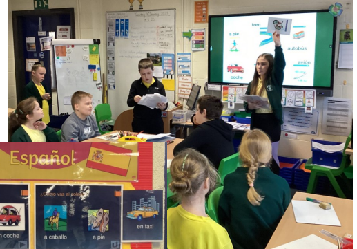
Year 5 have been learning how to describe how they travel to school.