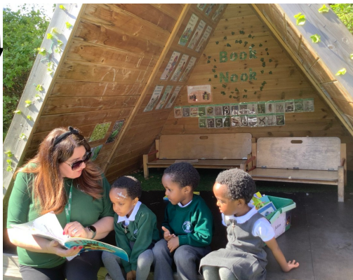
Nursery children love enjoying a story in the sunshine!

Year 3 have been working hard in their ‘Speaking Spotlight’, where they get to perform something from their Reading lessons that week. They create the performance themselves and then present to the whole class!