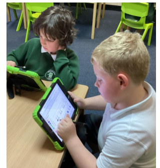
Year 2 have been using LetterJoin to practise their handwriting. The videos and guides support children in forming letters and how to join these. Children can use LetterJoin at home too!