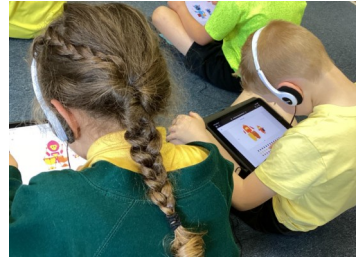
Year 2 have combined Computing with Music this week! They explored how music can evoke different emotions and then created their own digital rhythms to portray an animal’s movements, for example, an angry stomping elephant.