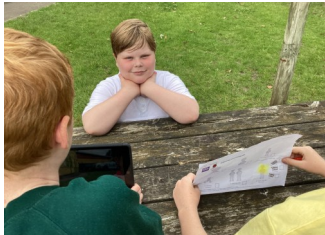
Year 5 have been exploring a variety of filming techniques and developing their speaking and listening skills both behind and in front of the camera.